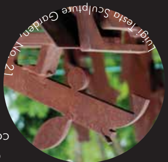
Luigi Testa Sculpture Garden, No. 21

The Springfield Arts Commission is an all-volunteer board committed to the belief that art is an important part of our shared identity and economic development. That's why we're passionate about promoting the arts, preserving our community's cultural heritage and supporting local artistic expression, exhibits, events and performances.