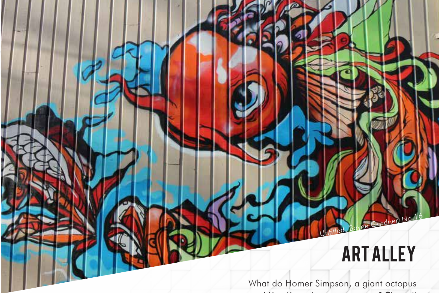
Untitled, Bayne Gardner, No. 16